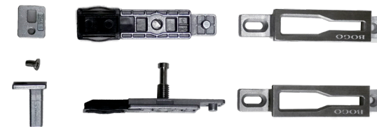
Door leaf T-piece + latch bolts and strike plate