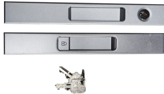
Door one-shaped lock